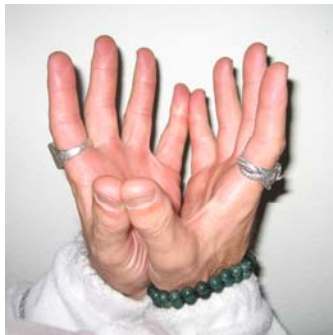
Planet Gong Peace Project Mudra

The vibration of the Gong will effortlessly release inner blockages or conflicts, bringing you to a state of harmony and peace.